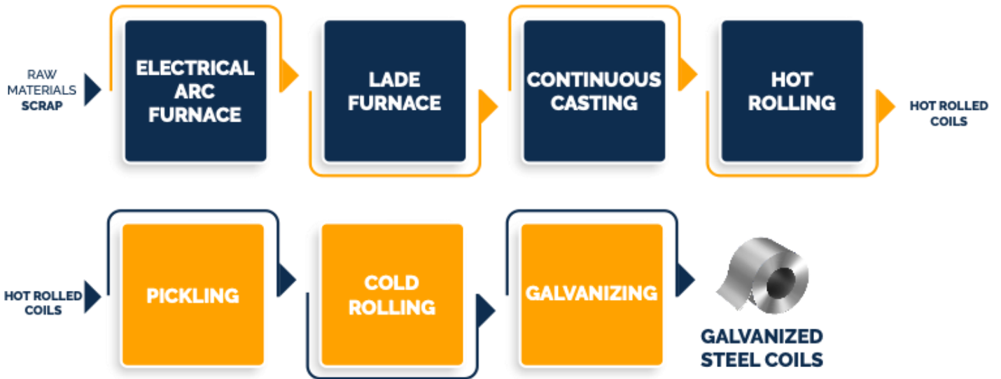
Figure 2: Galvanizing process.